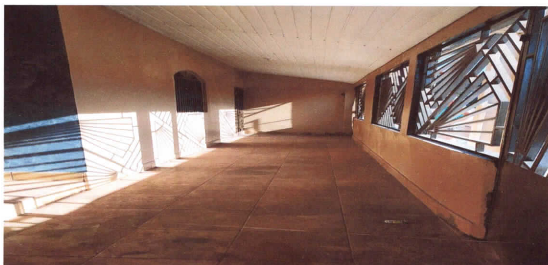
ÁREA FRENTE ABERTA